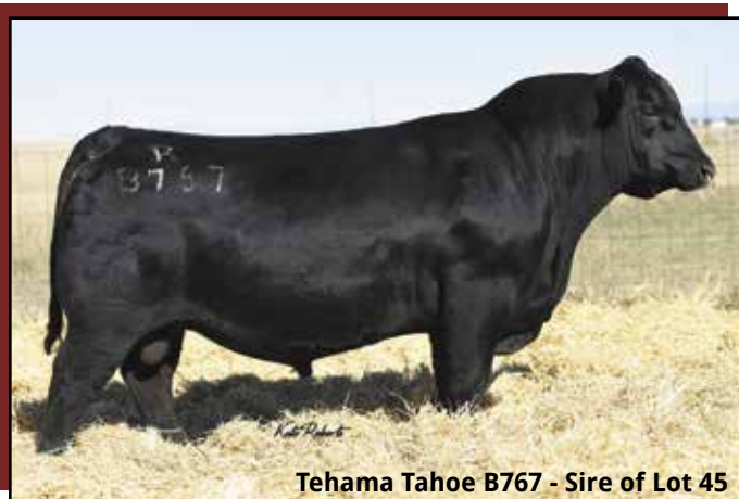
Tehama Tahoe B767 - Sire of Lot 45

White face, halter broke and bred to heifer semen! She's a well-made female that we showed as a calf, ready to be a great brood cow in your herd.