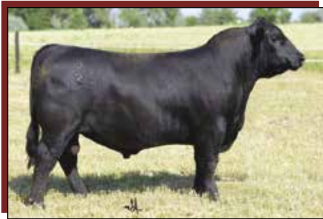
Baldrige Colonel Service Sire of Lot 38