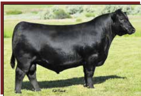
Musgrave Sky High 1535 Sire of Lots 29 and 55