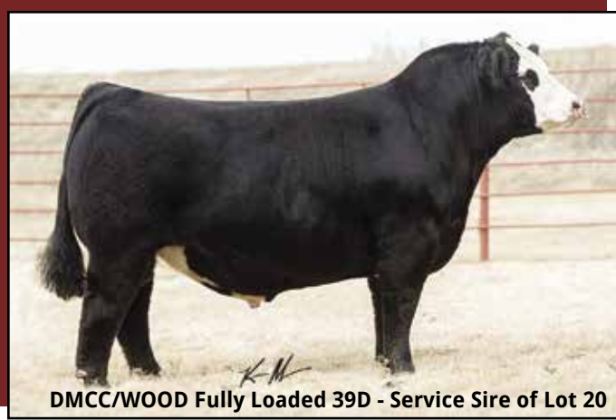
DMCC/WOOD Fully Loaded 39D - Service Sire of Lot 20