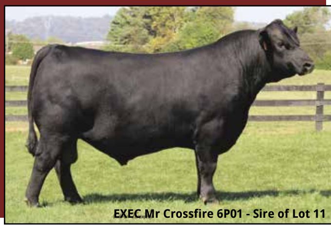
EXEC Mr Crossfire 6P01 - Sire of Lot 11

AI'd to THSF Lover Boy B33 (ASA# 2983443) on 5/1/23. Due 2/7/24. Tybenal's Whitney is one that's going to make a really good cow. She's got a big top, lots of natural muscle shape and carries the red gene that makes for unlimited mating options. Bred to Lover Boy for an exciting first calf. Video available on Tybenal Farm Facebook page.