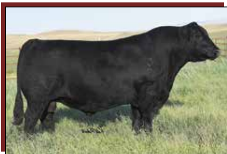
EXAR Monumental 6056B Sire of Lots 31 and 32