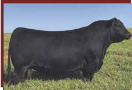
S A V America 8018 Service Sire of Lot 51