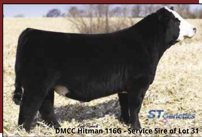
DMCC Hitman 116G - Service Sire of Lot 31

AI'd to LLW Card True North G71 (ASA# 3640090) on 4/28/23. Well behaved bred heifer due in February to True North. She's moderate framed, sound and will make a great addition in any herd.