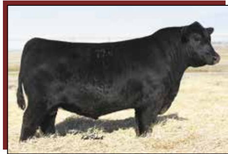
Sitz Stellar 726D Service Sire of Lot 50