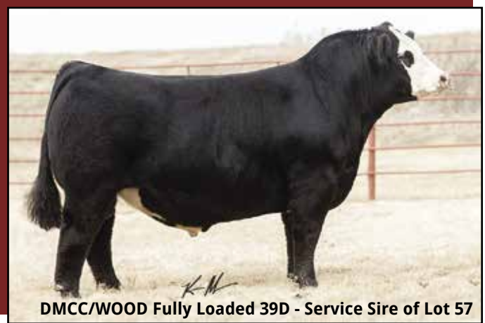
DMCC/WOOD Fully Loaded 39D - Service Sire of Lot 57

Here's a Mitty In Focus cow who has the CAB brand stamp. She is out of one of our favorite cows here at CVAF. Her dam raised the Grand Champion Steer of the WV State fair in 2020. Carries the CAB brand stamp