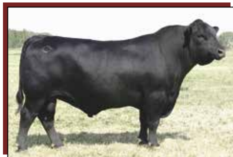
Mytty In Focus • Sire of Lots 54, 57, 58 Grandsire of Lots 25, 37, 38, 41