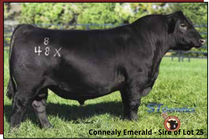
Connealy Emerald - Sire of Lot 25

2025 is another Cathy daughter out of Emerald. She is a flashy female with calving ease and quality carcass. Carries the CAB brand stamp