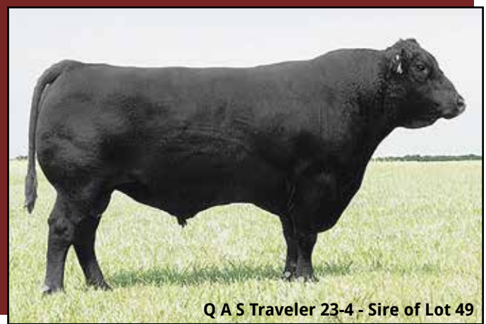
Q A S Traveler 23-4 - Sire of Lot 49

This one is a strong mother who hails from the QAS Traveler 23-4 bull. She weaned a strong Rawhide bull calf at 655lb. We will be developing her calf in our bull development program for future herd use.