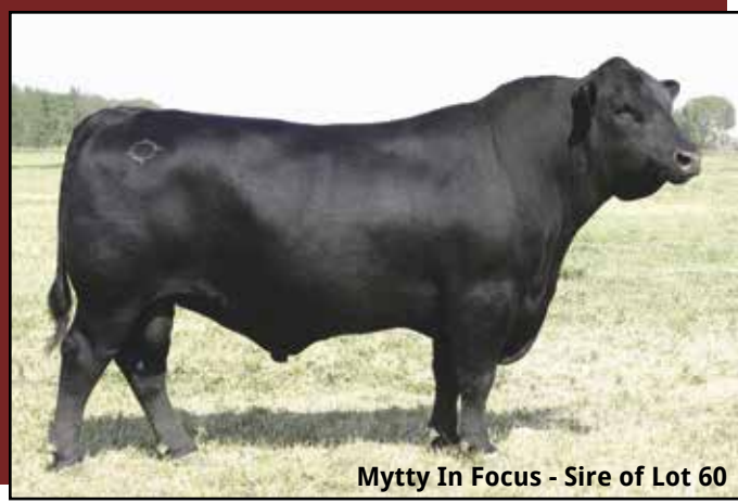
Mytty In Focus - Sire of Lot 60