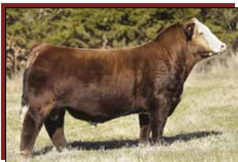
SJF SMJ Payroll Service Sire of Lots 60 and 64