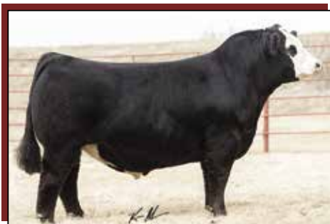
DMCC/Wood Fully Loaded 39D Service Sire of Lots 5, 20, 22, 33, 36, 54 & 66