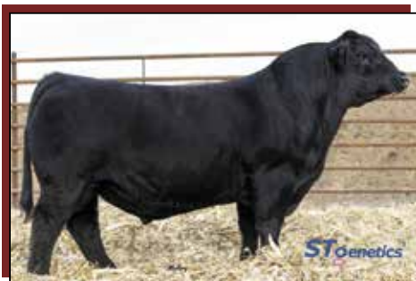
OMF Epic E27 Service Sire of Lots 3, 7, 9, 13, 17 and 47