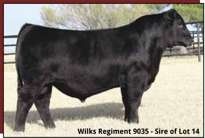
Wilks Regiment 9035 - Sire of Lot 14

Great all around brood cow prospect here. Calving ease with balanced EPDs and exceptional feminine phenotype. This heifer has a lot of eye appeal and a pedigree filled with maternal greats.