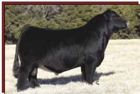
Geff County O Service Sire of Lots 58, 59, 61, 63